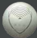
Assorted kinds of RFID check points